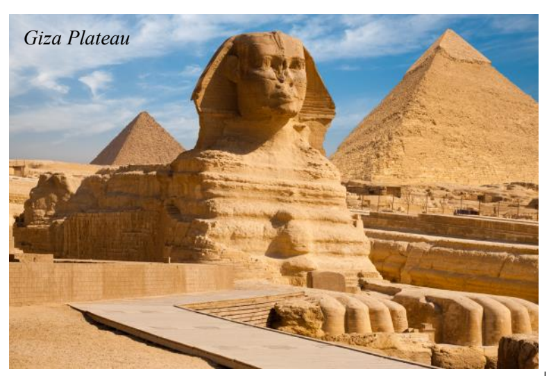
Day 1: Friday, October 17, 2025 • Depart for Egypt Our Egyptian journey starts today as we board our flight for Egypt. In Flight Meals