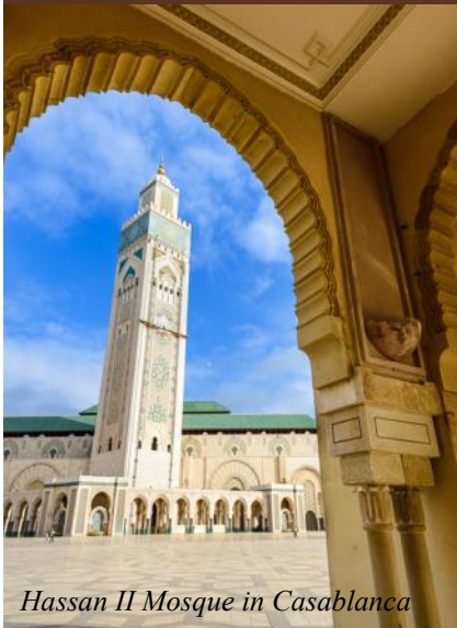
Hassan II Mosque in Casablanca