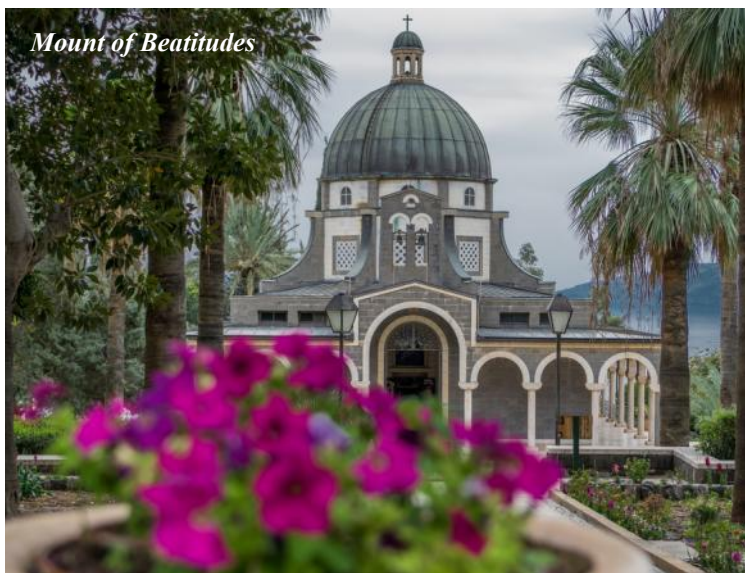
Mount of Beatitudes