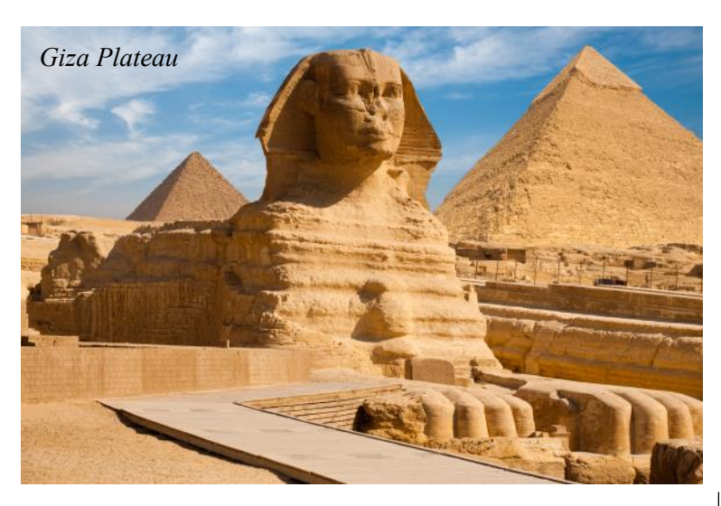
DAY 1: Saturday • Depart for Egypt Depart for Egypt.