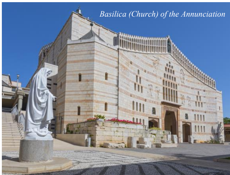
Basilica (Church) of the Annunciation