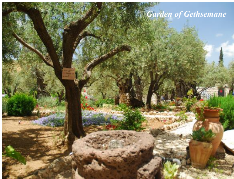
Garden of Gethsemane