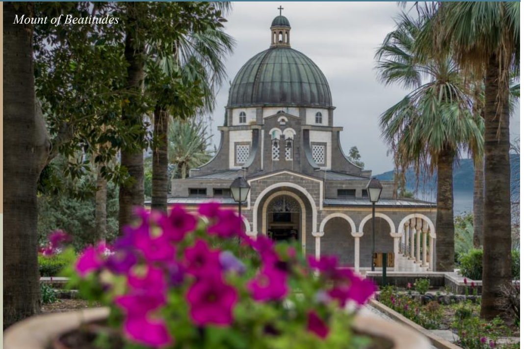
Mount of Beatitudes