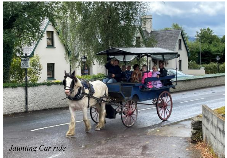
Jaunting Car ride

Today we depart for Cork, stopping at the Rock of Cashel, a