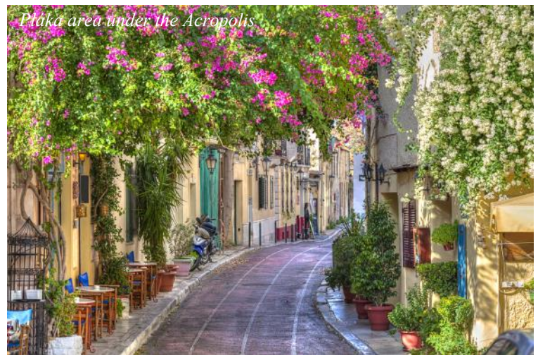
Day 1: Thursday, September 18, 2025 • Depart Our adventure starts today as we depart the USA on our scheduled flight to Athens, Greece.